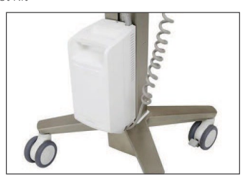
LiFeKinnex™ Power System