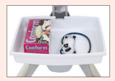
SV Front Tray